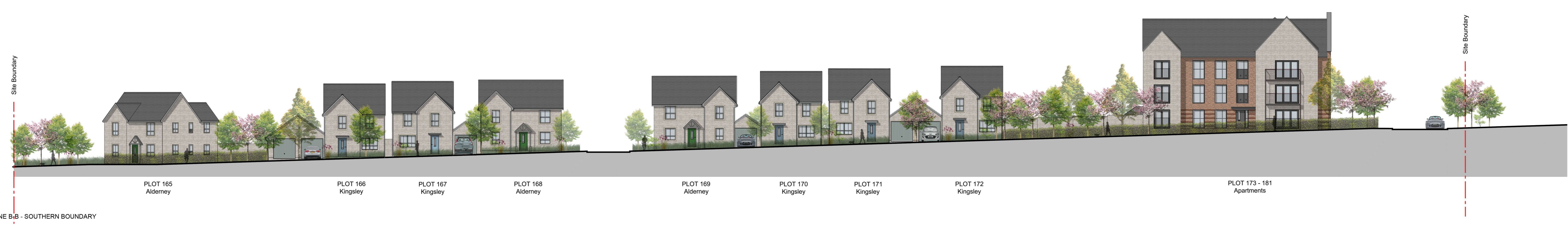
STREET SCENE B-B - SOUTHERN BOUNDARY