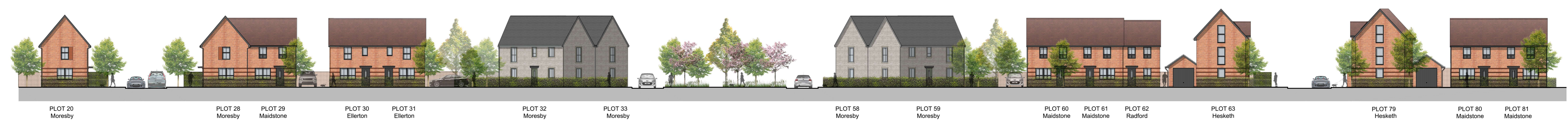
STREET SCENE C-C - WESTERN GREEN