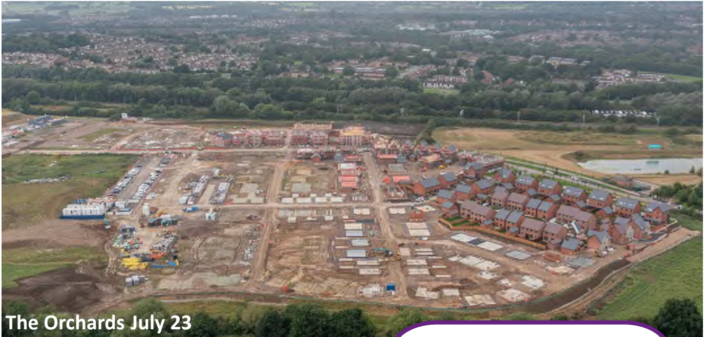
The Orchards July 23