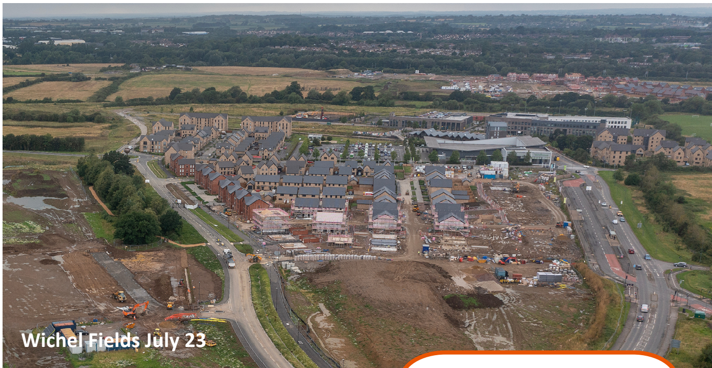
Wichel Fields July 23