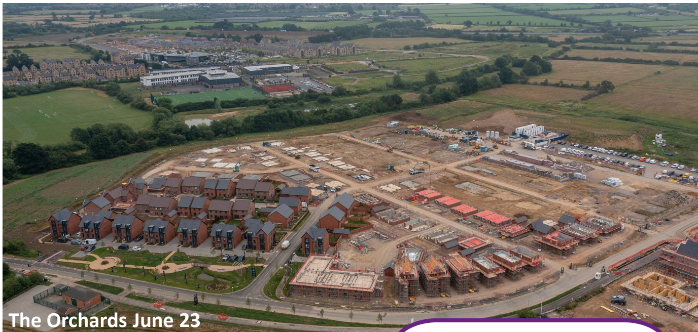
The Orchards June 23