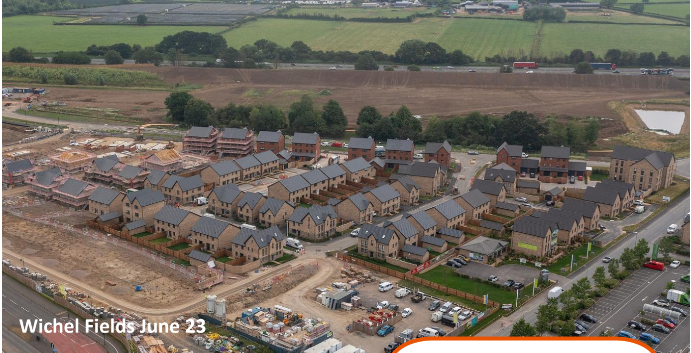
Wichel Fields June 23