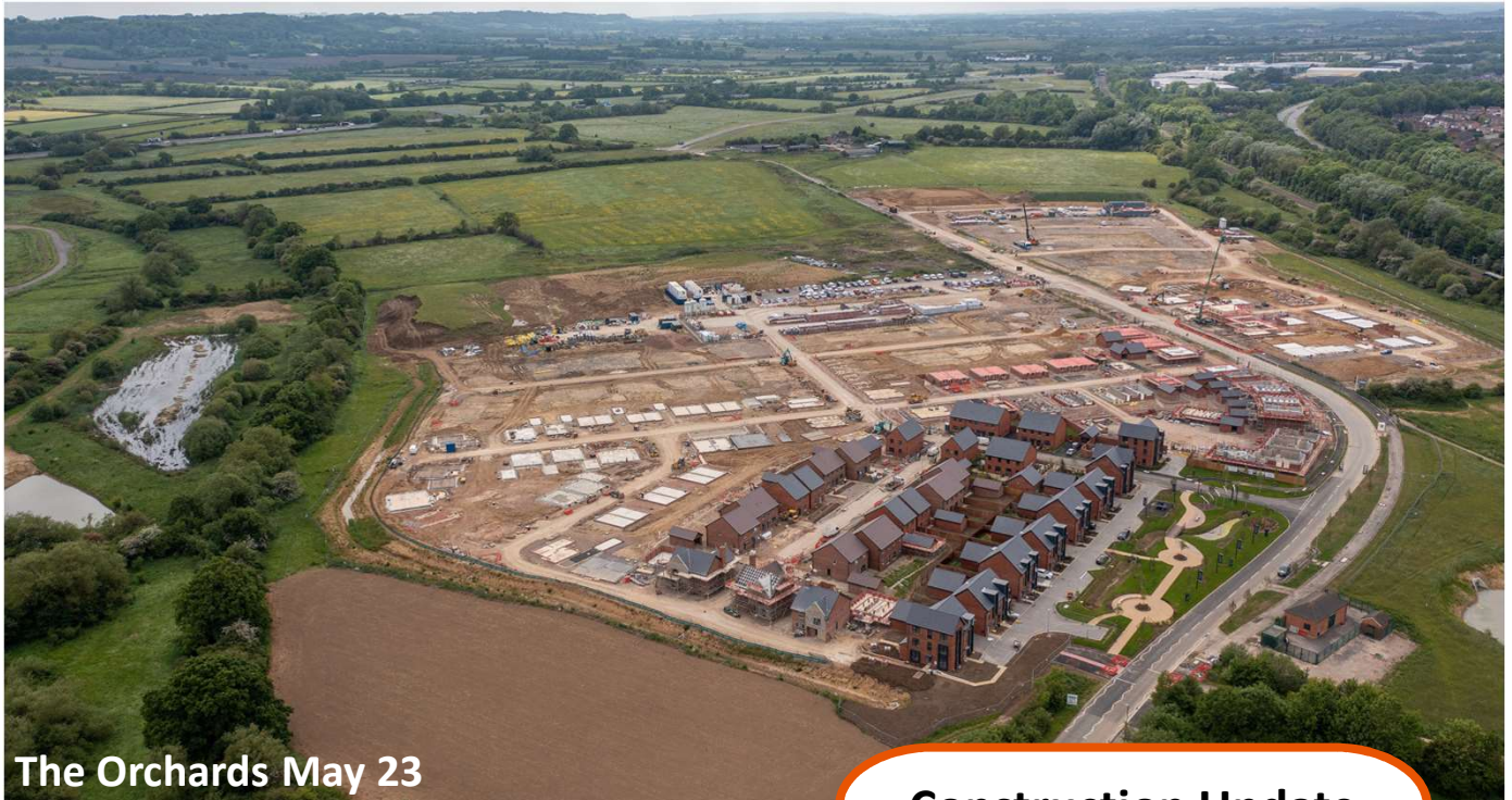
The Orchards May 23