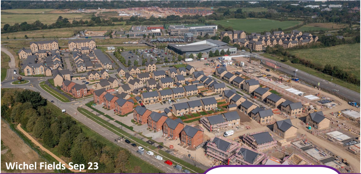
Wichel Fields Sep 23