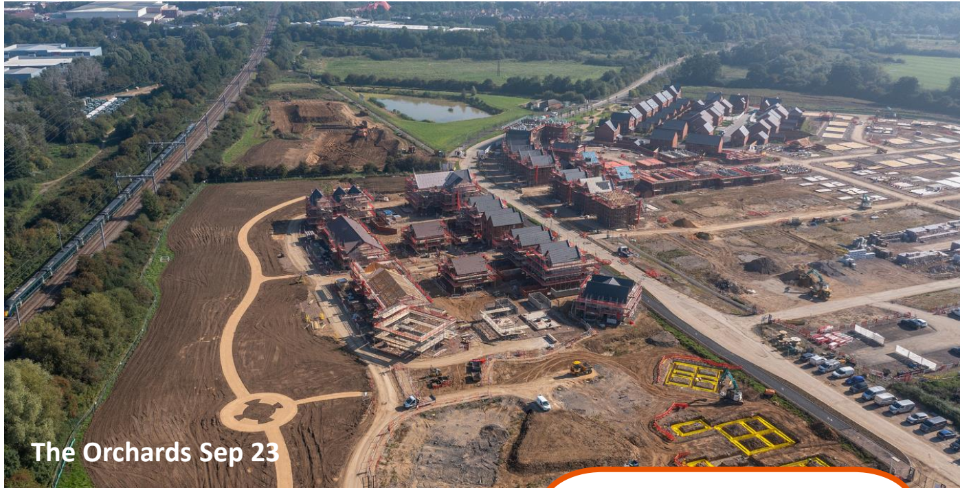
The Orchards Sep 23