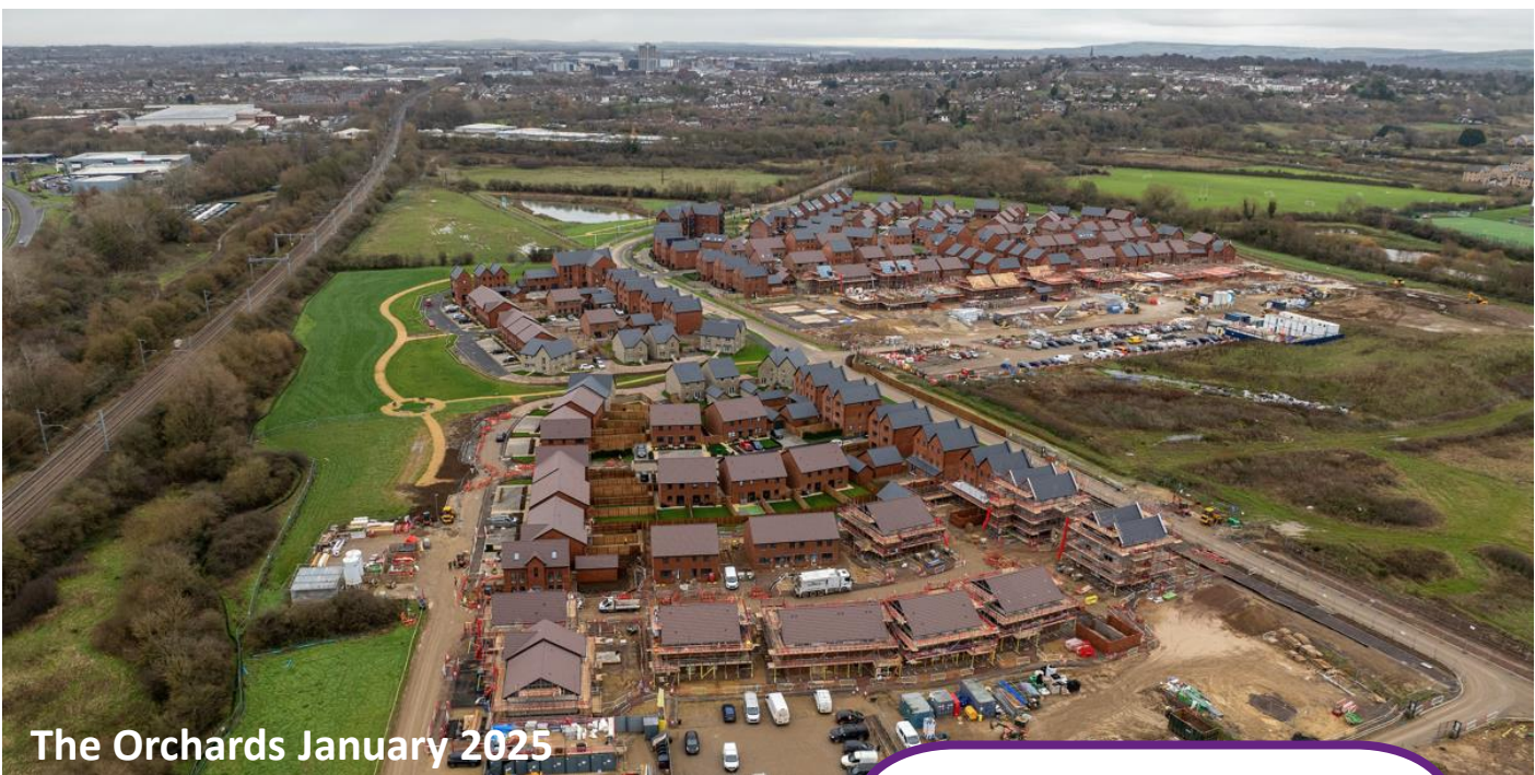
The Orchards January 2025